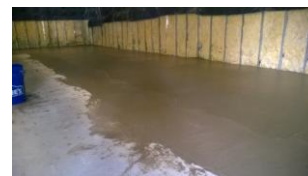
Studio A Floor Repairs

Keeping the facility in state-of-the-art condition is always a goal of the organization. In 2016 new cameras were purchased for Studio B which will enable producers to create professional looking programs for their audiences. In addition, the floor in Studio A was replaced making it much easier on producers who no longer need to worry about areas of the studio which were undesirable due to cracks and other issues in the flooring.