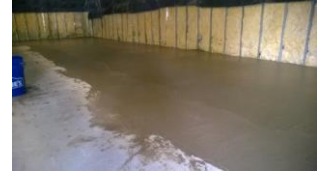
Studio A Floor Repairs

Keeping the facility in state-of-the-art condition is always a goal of the organization. In 2016 new cameras were purchased for Studio B which will enable producers to create professional looking programs for their audiences. In addition, the floor in Studio A was replaced making it much easier on producers who no longer need to worry about areas of the studio which were undesirable due to cracks and other issues in the flooring.