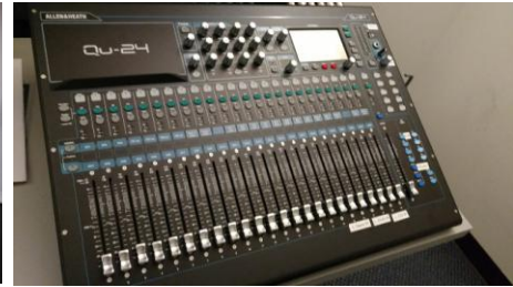
Digital Audio Board includes creating and saving individual setups.