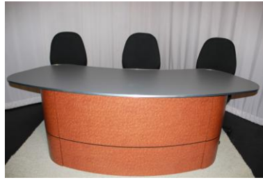
2 new modular tables enable multiple looks and sizes.