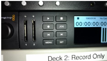
Hyperdecks play and record HD footage on SD Cards.

Keeping the facility in state-of-the-art condition is always a goal of the organization. In 2017 new HD recording decks, character generators and audio boards were purchased completing our conversion to a totally HD capable facility. New set furniture was also purchased which will allow producers to create more professional and modern looking sets. All of this will allow producers to create high quality programs in high definition, not only for distribution on traditional cable outlets, but also on other internet based video platforms.